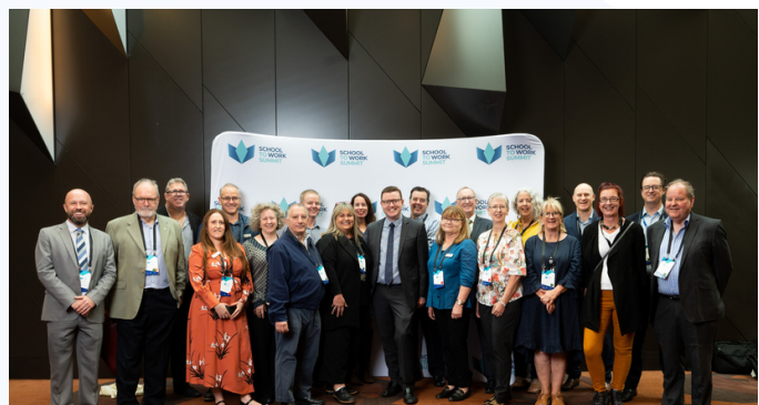
Victorian LLENs' Executive Officers