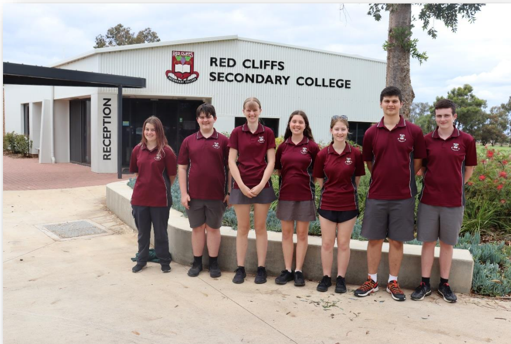
Pic above: Year 9 2021 STEM4Sunraysia participants from Red Cliffs Secondary College presented a very impressive solution for Cooke Industries- Manufacturing problem.