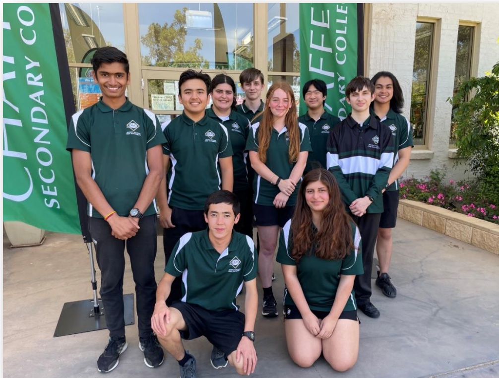
Pic above: Year 9 2021 STEM4Sunraysia participants from Chaffey Secondary College presented the winning solution for Mildura Paddle Steamers

Watch the 2021 STEM4Sunraysia Teaser here