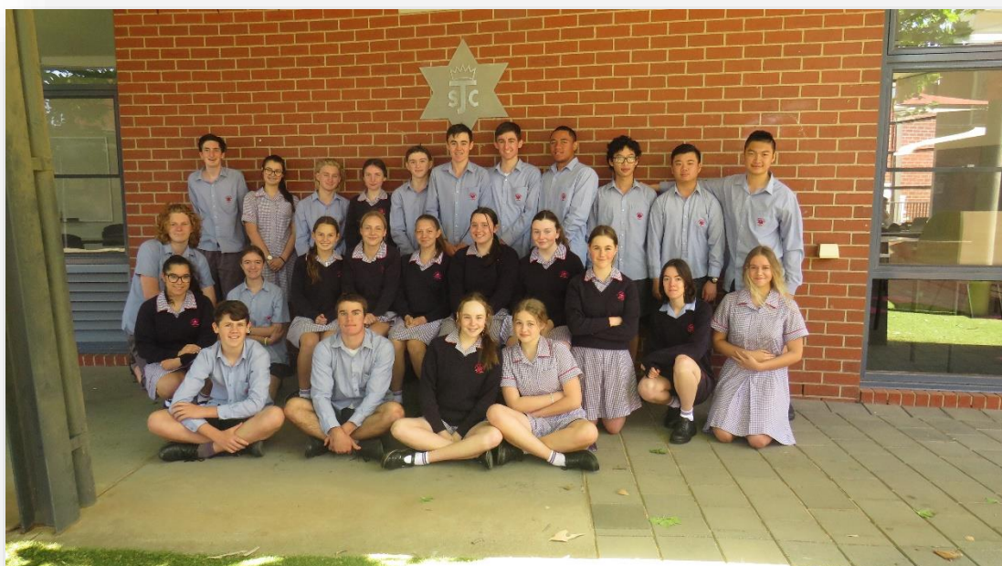
Pic above: Year 9 2021 STEM4Sunraysia participants from St. Joseph's Secondary College presented a very impressive solution for SuniTAFE SmartFARM Marketing problem.